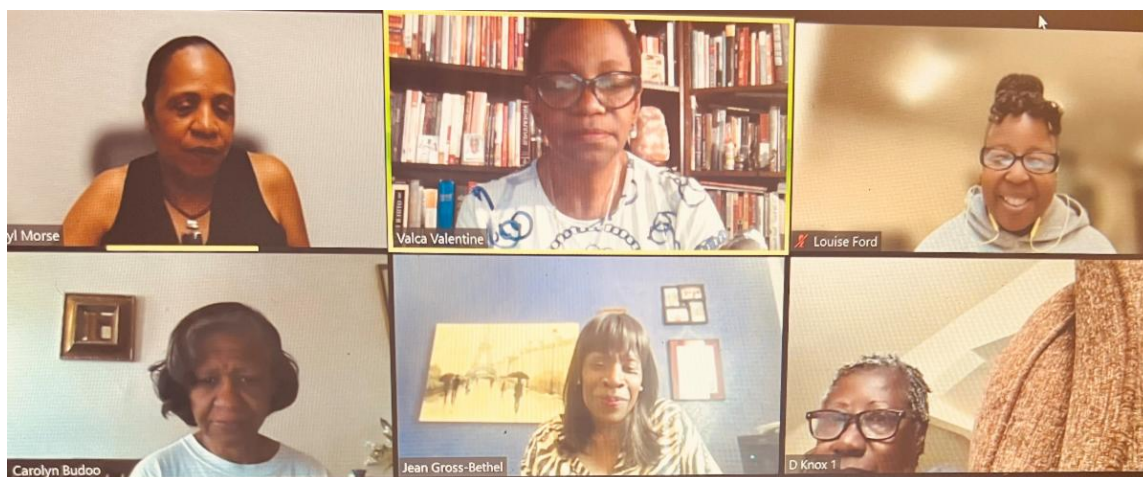
Observing Older Americans Month, OPC outreach staff talk about benefit programs that help seniors pay utility bills on a Zoom